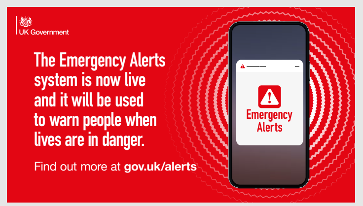
Social static1920x1080, also available as 1080x1920