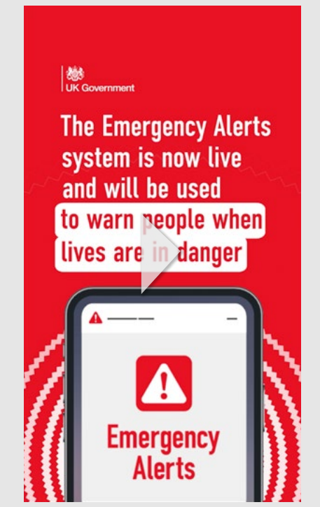
Social animated 1080x1920 Also available as 1080x1080 and 1920x1080