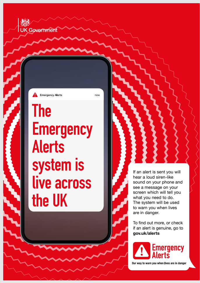
A3 Poster Also available as A4